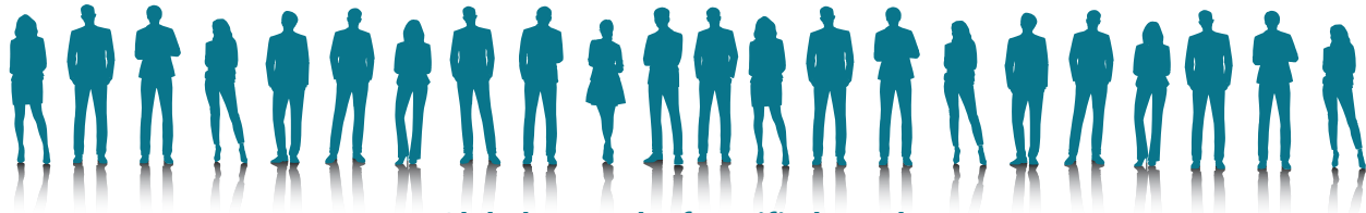
Global network of certified coaches

We provide a digital environment that supports organizational learning, change and growth initiatives through one to one coaching & mentoring as well as learning & education approaches . Our personalized services are dedicated to focus on your executive, his needs, difficulties and challenges in order to improve his awareness, thus enhancing his decision making for stronger results.